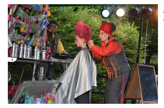
SIENTA LA CABEZA (Barcelona, Spain)