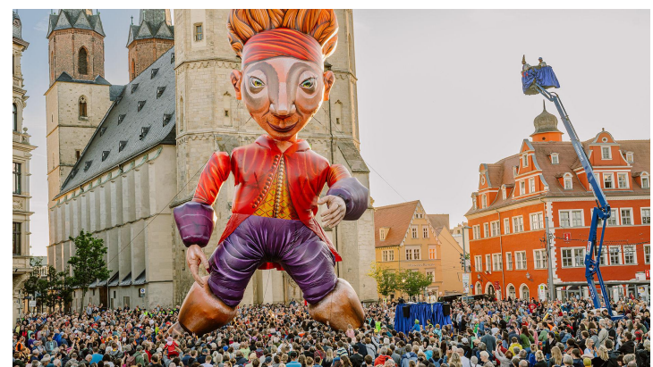
Plasticiens Volants had three successful US tours with Rochester Fringe Festival and Artpark and will be presented in partnership with Rochester Fringe Festival.

Plasticiens Volants , founded in 1976, revolutionized street theater with their use of giant inflatable puppets and aerial storytelling. Their visually stunning performances, often featuring fantastical creatures soaring above the crowd, have made street theater a more immersive, communal experience. Through works like La Ballade des Anges and their involvement in large events like the Olympics and international festivals, Plasticiens Volants brought visual grandeur to street performances, proving that ephemeral art in public spaces could achieve the same awe and technical sophistication as traditional theater.